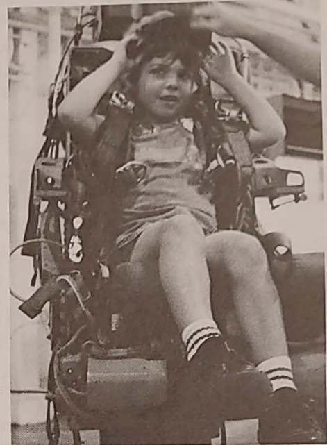
Last month's Family Appreciation Day proved to be a success. Above, a 507th dependent gets a "ride" on an ejection seat simulator. in aptitude, and have a composite score of at least 100. (AFRESNS)

Now they must be commissioned before reaching age 35. Additionally, the required Air Force Officer Qualification Test scores are different. Applicants must now score a minimum of 15 in verbal, 10 in quantitative and 15